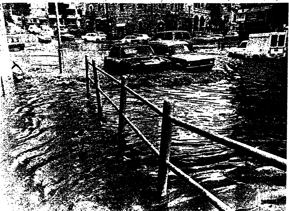
Jerusalem's Rehov Mamilla intersection with Agron and King David Streets turned into a lake Friday when the capital's drainage system failed to cope with the heavy onslaught of rain that hit the city. (Story — page 2)